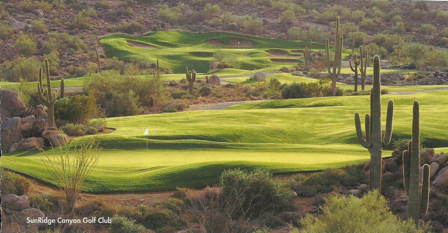
SunRidge Canyon Golf Club

see some major league players on the course. arizonanationalgolfclub.com